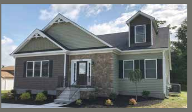
Bello Machre's newest home (Post Road) opened in 2019. Learn more on page 4.

"Lifelong care means lifelong income. Lifelong income to support people with developmental disabilities for generations to come. We are so thankful for every dollar donated to Bello Machre."