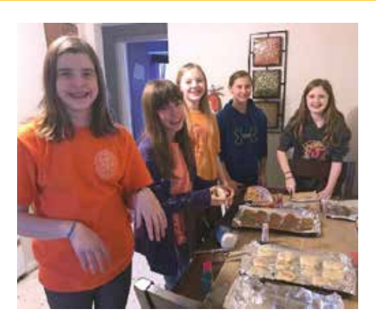
Members of St. Margaret's Episcopal Church's youth group proudly display the cookies they made while visiting our St. Margaret's home.