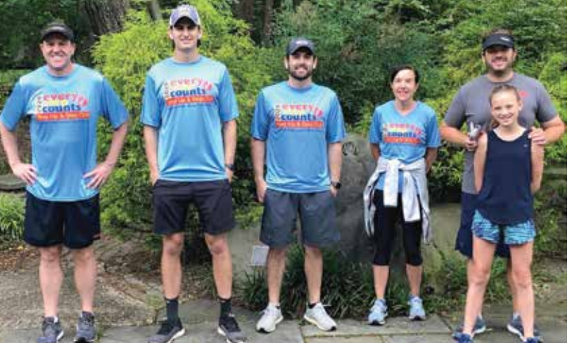
Corporate Brokers runs for a cause