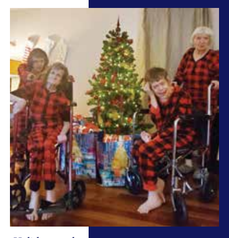
Holidays and birthdays are extra special at the Evergreen home

"During this tough year, smiling faces make it all worth it!"