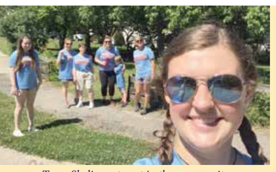
Team Skyline gets out in the community