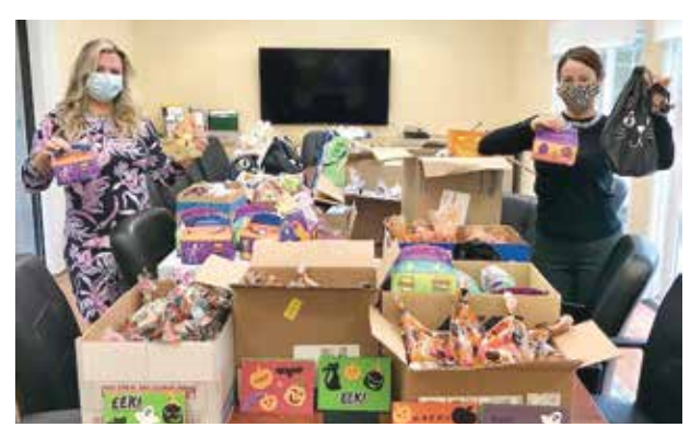
First National Bank donates over 600 Halloween goody bags to bring smiles to the faces of everyone we support