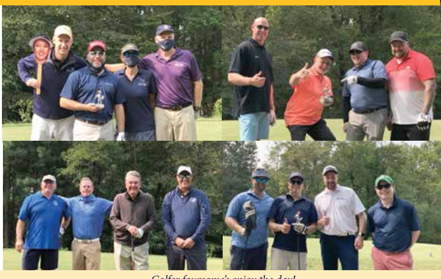
Golfer foursome's enjoy the day!

Childs Landscape Contractors Civitan Club of Glen Burnie Homelight, Inc. Kelly & Associates Insurance Group/KELLY Payroll Sirus Systems Travel by LuAnn