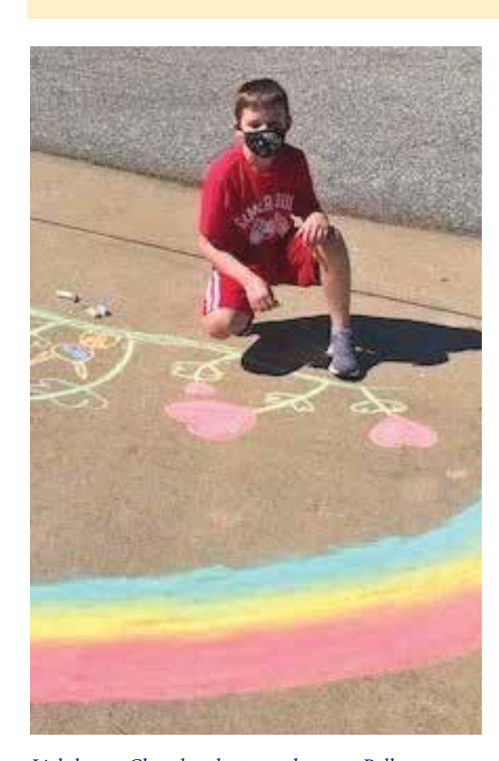
Lighthouse Church volunteers decorate Bello Machre homes' driveways during the church's annual Love Week

"I love volunteering at Bello Machre because everyone is always so upbeat and positive. It's great to be part of a volunteer team that lifts your spirits while you work. Seeing the joy that volunteering brings to the people Bello Machre supports always warms my heart! These days, it is more important than ever to reach out to others. The smiles that emanated from folks — even under their masks — when I delivered cookies during Every Step Counts prove that human contact is vital to our mental and emotional well-being. After all, just because we have to practice social distancing doesn't mean we can't be social."