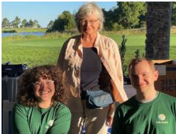
VIP registration with a smile.

We hope to see you on Wednesday, September 13, 2023 , for our 39th Annual Golf Tournament! 🌟