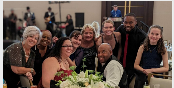
Staff and guests enjoy the live music and spending the evening together.

disabilities. The dream of our founding parents — for all people with developmental disabilities to live joyfully, feel love, and find meaning in the communities in which they live — was now a reality.