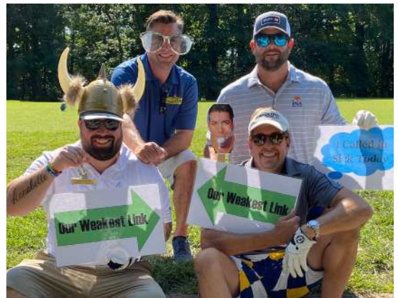
Worst Drive Hole