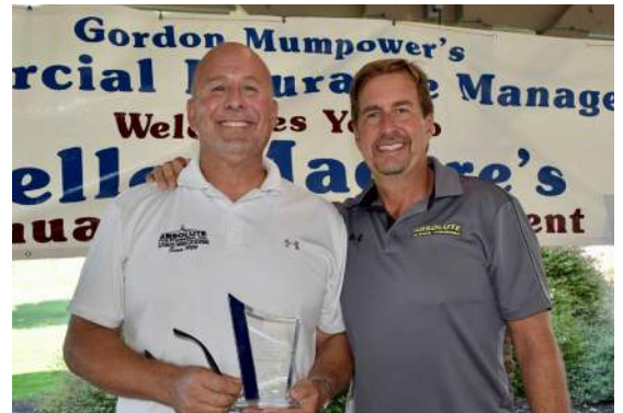
Absolute Fire Protection

Check out our Golf Tournament 2022 video on YouTube! youtube.com/bellomachreinc