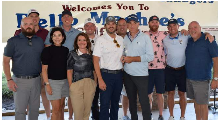
Tential group gathers for a photo.