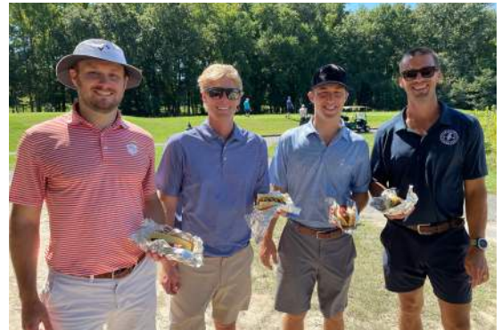
A sausage break for this foursome!