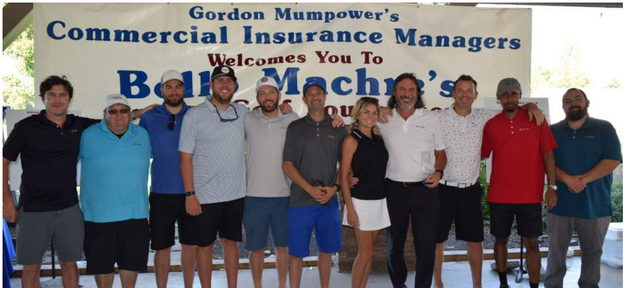
SCLogic's perfect line up!