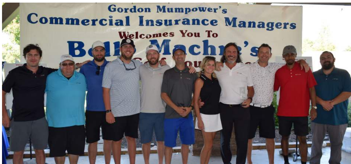
SCLogic's perfect line up!