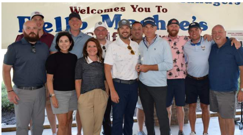
Tential group gathers for a photo.