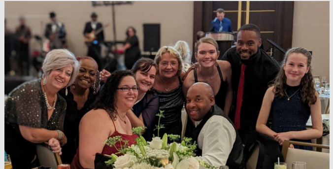
Staff and guests enjoy the live music and spending the evening together.

disabilities. The dream of our founding parents — for all people with developmental disabilities to live joyfully, feel love, and find meaning in the communities in which they live — was now a reality.