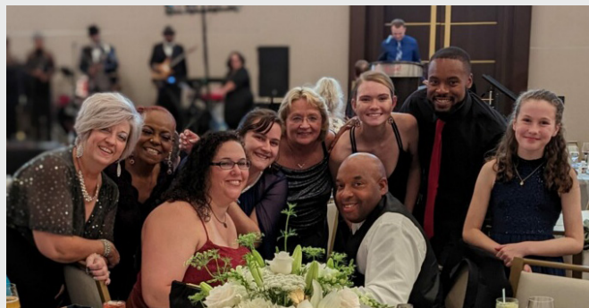
Staff and guests enjoy the live music and spending the evening together.

disabilities. The dream of our founding parents — for all people with developmental disabilities to live joyfully, feel love, and find meaning in the communities in which they live — was now a reality.