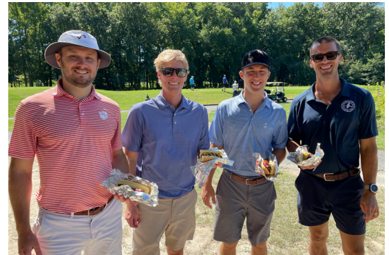
A sausage break for this foursome!