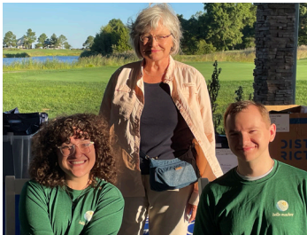
VIP registration with a smile.

We hope to see you on Wednesday, September 13, 2023 , for our 39th Annual Golf Tournament! 🌟