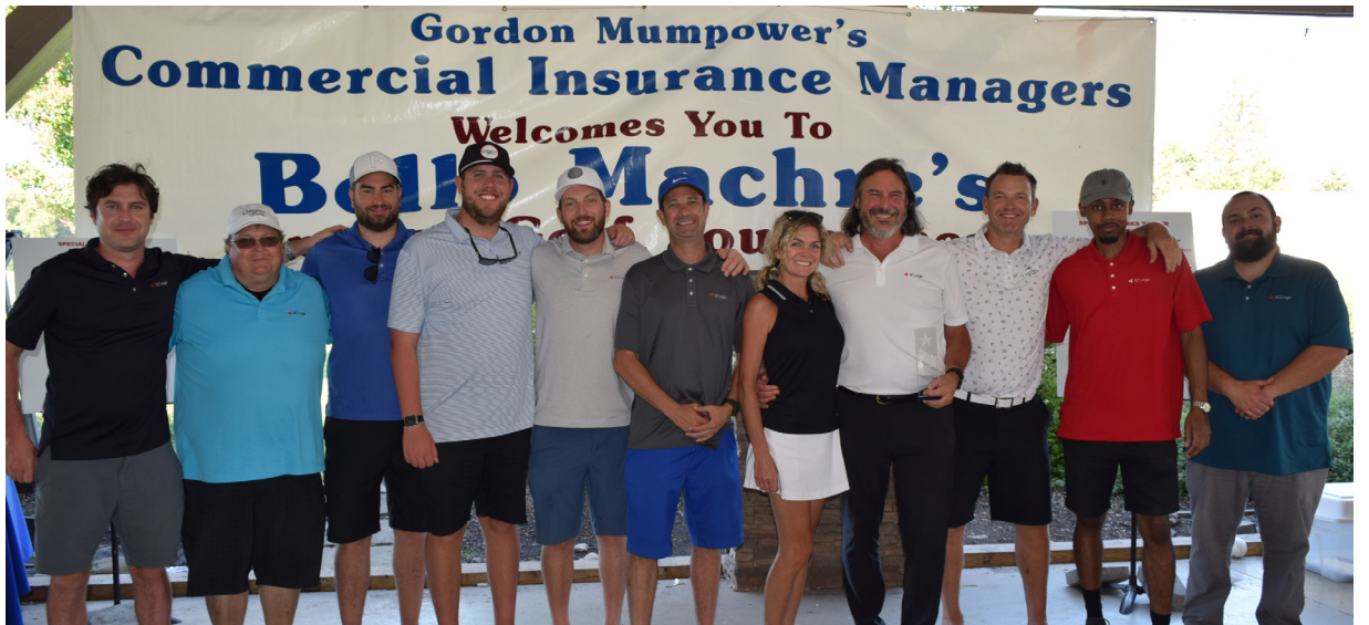
SCLogic's perfect line up!