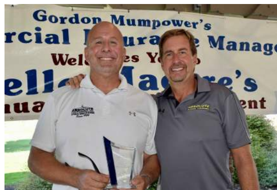
Absolute Fire Protection

Check out our Golf Tournament 2022 video on YouTube! youtube.com/bellomachreinc