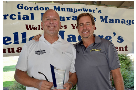
Absolute Fire Protection

Check out our Golf Tournament 2022 video on YouTube! youtube.com/bellomachreinc