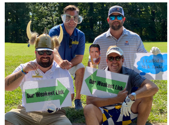
Worst Drive Hole