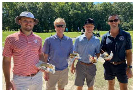
A sausage break for this foursome!