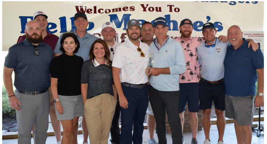
Tential group gathers for a photo.