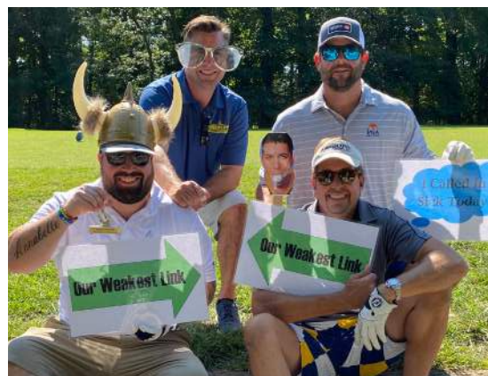
Worst Drive Hole