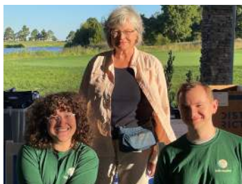
VIP registration with a smile.

We hope to see you on Wednesday, September 13, 2023, for our 39th Annual Golf Tournament! 🌟