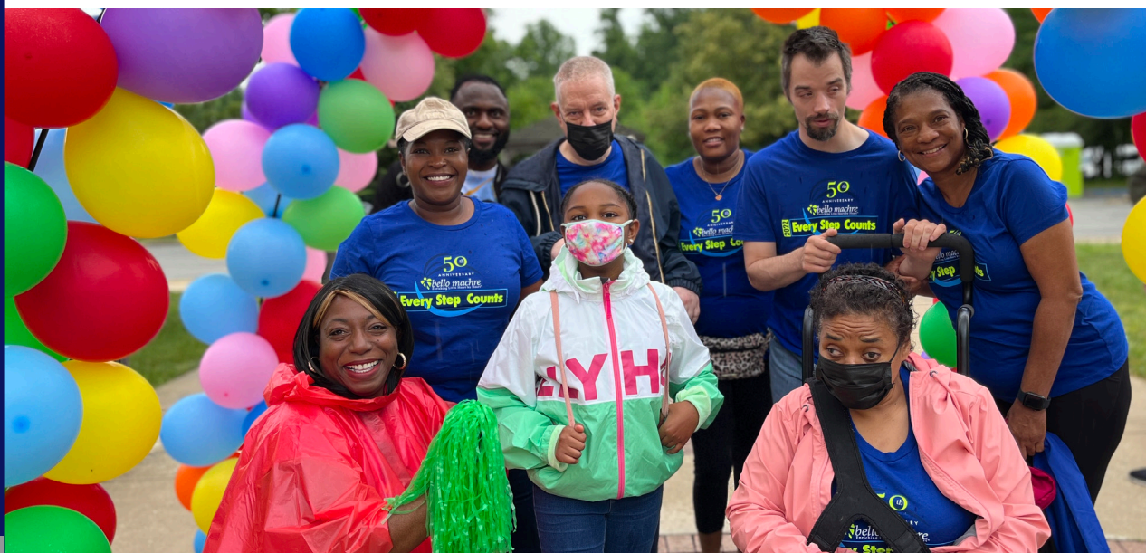
Bello Machre family unites at Every Step Counts 2022.