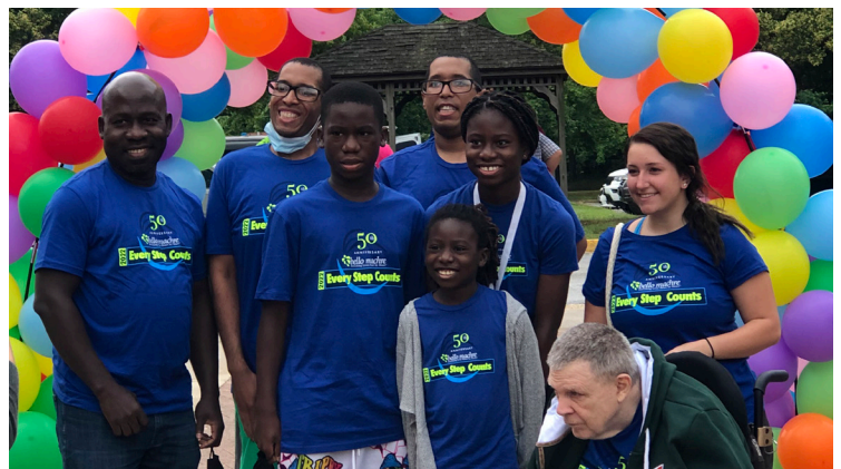
The Sage Home never misses an ESC celebration!