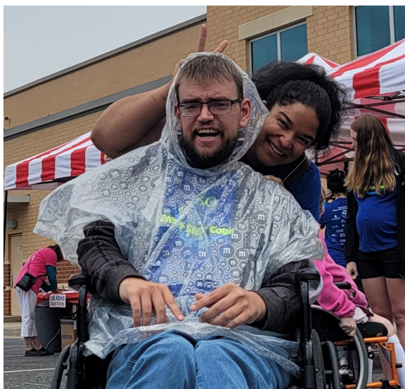
Rain or shine in Carroll County!