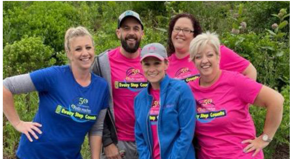
Carroll County crew.