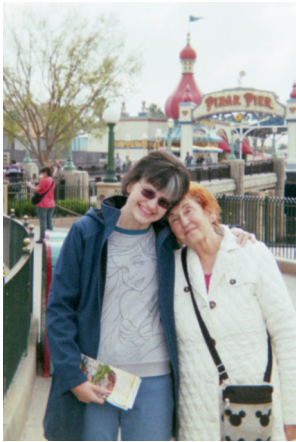
Special moments at the Magic Kingdom.