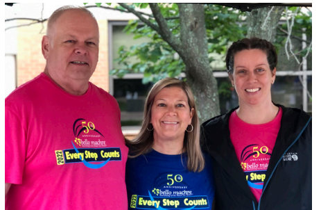
Bello Machre volunteers rock!