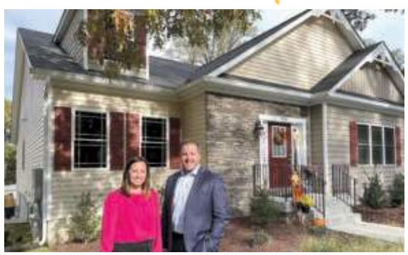
Bello Machre's Central Lane Home financed by the Community Bank of the Chesapeake.

Bello Machre is pleased to announce a $50,000 charitable giving commitment from Community Bank of the Chesapeake (CBTC), payable over the next three years. CBTC's gift to Bello Machre is the latest in its four-year giving history to the organization. When this latest commitment is completed, CBTC will have contributed nearly $90,000 since 2017, in support of Bello Machre's Every Step Counts, Golf Tournament, and 50th Anniversary Celebration.