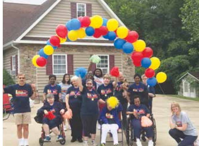
Allan Drive Home community walk.