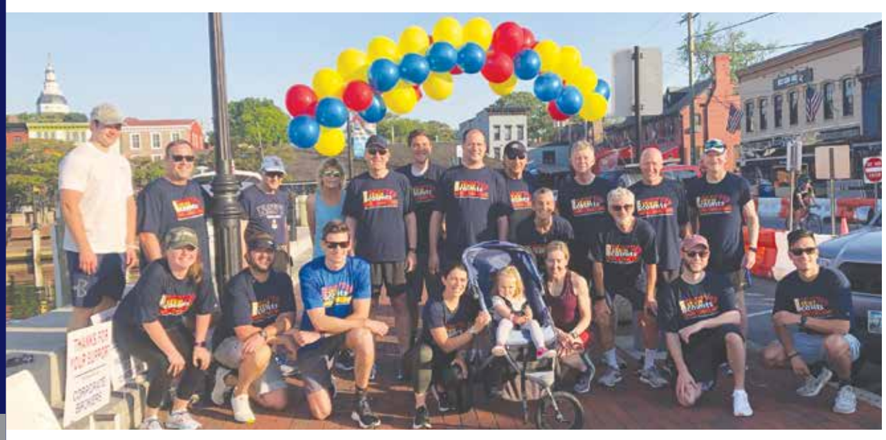
Corporate\ Brokers\ and\ Progressive\ Title\ got\ together\ for\ their\ own\ 5K\ at\ the\ Annapolis\ Harbor.